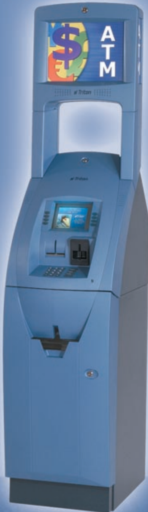
9700 with backlit high topper

Triton's 9700 Series ATMs are the perfect low-cost solution for today's retail ATM market. These sleek, new machines offer legendary Triton reliability and a host of standard features that are upgrades on other ATMs—all at an unbeatable price. That's what makes the 9700 the new workhorse of the industry.