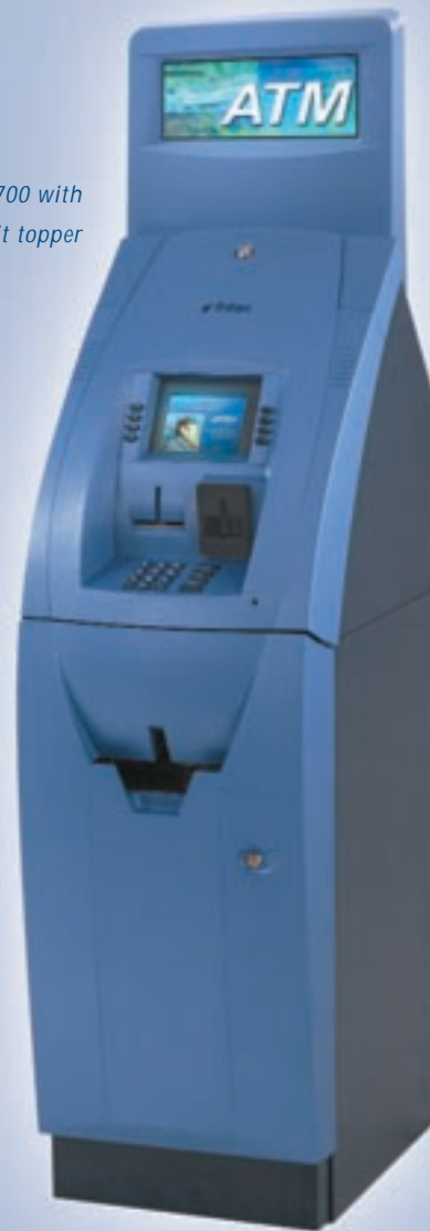
9700 with backlit topper