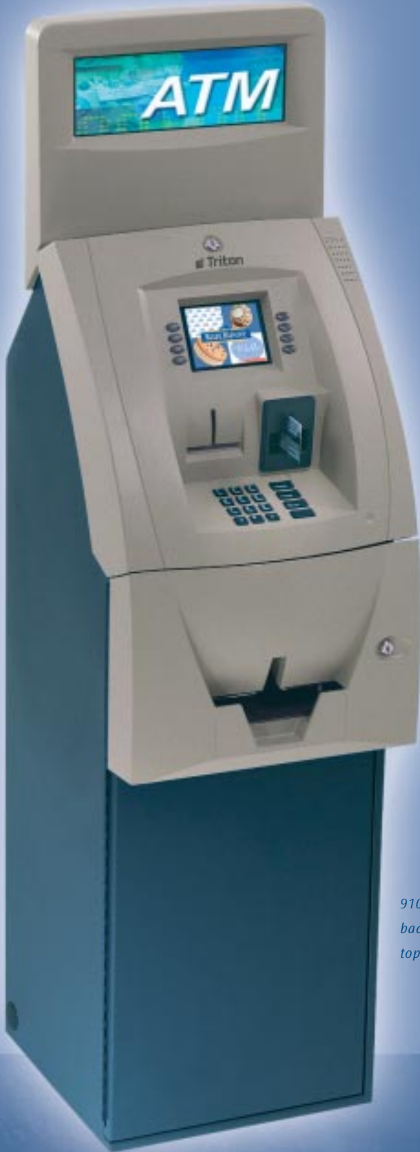
9100 with backlit topper

The 9100 is our best selling ATM. This extremely popular machine was designed to be the lowest cost high-performance ATM in the industry. And it has proven to be perfectly suited for owners who need functionality and performance at a lower price point.