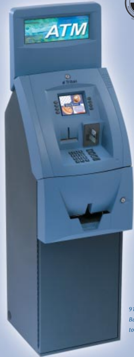
9100 with Backlit topper